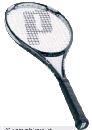
9X405000 03 white mini racquet