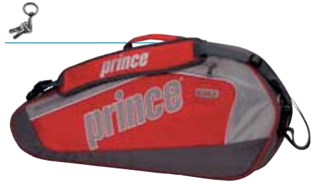
SIZE 29.5" L x 13" H x 16" W 6P711062 grey/red/silver