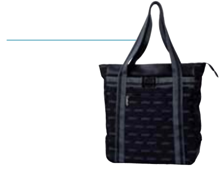
SIZE 14.5" L x 16.25" H x 5.5" W 6P716015 black/grey