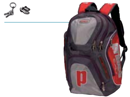
SIZE 12.5" L x 18.75" H x 8.25" W 6P715062 grey/red/silver