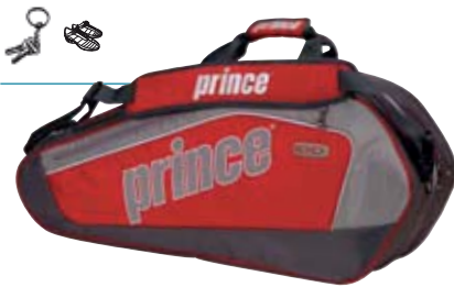
SIZE 29.5" L x 13" H x 16" W 6P712062 grey/red/silver