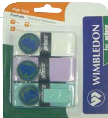
7H788131 dampener / grip fun pack