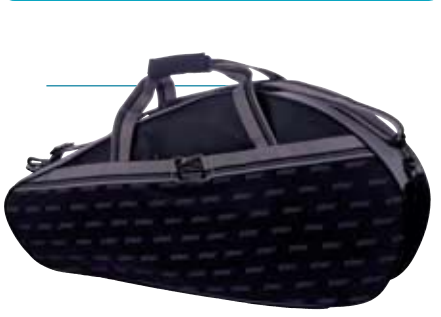
SIZE 29.5" L x 13" H x 4.5" W 6P742015 black/grey