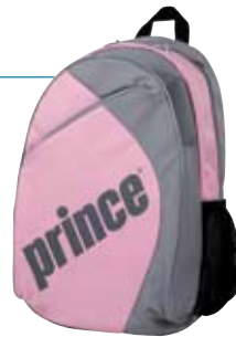
SIZE 11.5" L x 19" H x 8" W 6P723120 pink/grey