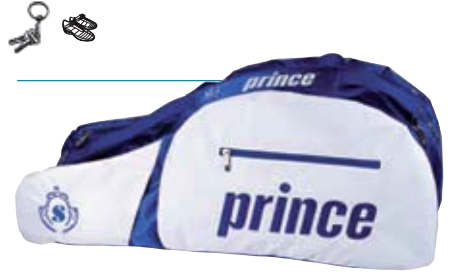
SIZE 32.5" L x 13.5" H x 10" W 6P710551 royal/navy/white