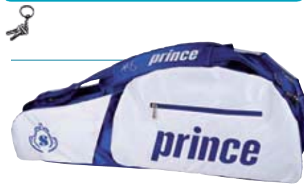
SIZE 32.5" L x 13.5" H x 5" W 6P709551 royal/navy/white