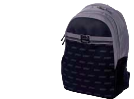
SIZE 15.5" L x 19" H x 7.5" W 6P743015 black/grey