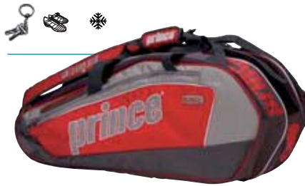
SIZE 29.5" L x 13" H x 16.25" W 6P713062 grey/red/silver