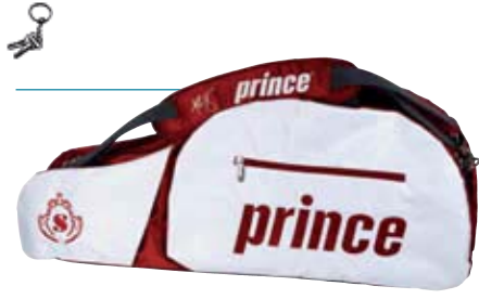
SIZE 32.5" L x 13.5" H x 5" W 6P709114 rose/grey/white