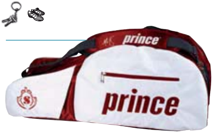
SIZE 32.5" L x 13.5" H x 10" W 6P710114 rose/grey/white