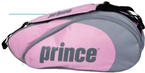
SIZE 31" L x 14" H x 8" W 6P722120 pink/grey