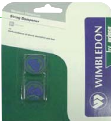
7H787040 wimbledon dampener twin pack