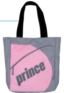
SIZE 13" L x 16" H x 5.5" W 6P724120 pink/grey