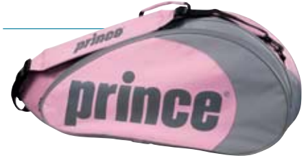
SIZE 31" L x 14" H x 5" W 6P721120 pink/grey